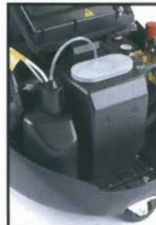
Integral water tank with softener (138DS only)