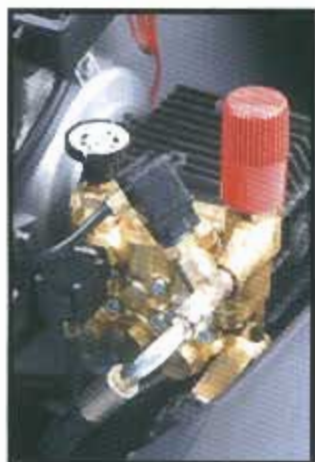
Brass Pump Head