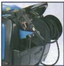
Optional Hose Reel