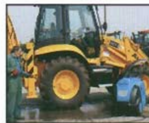
Building & Construction Cleaning