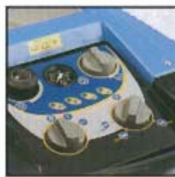
Simple to use controls